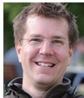
Arp Schnittger, University of Hamburg